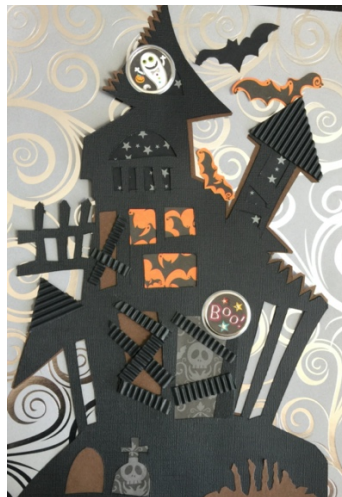
haunted house from papers